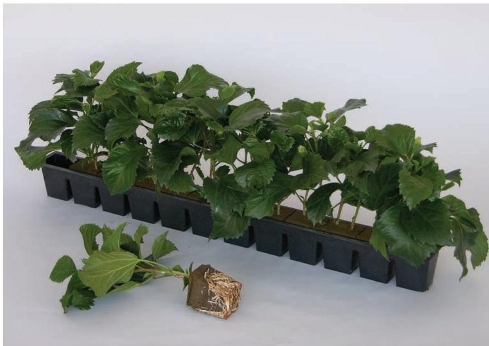
Pictured: Cool Wind

Ideal for in-home décor or on the patio... anywhere a splash of color is desired. Not hardy outdoors at temperatures below 30°F.)