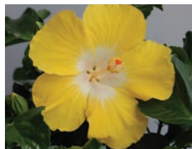
NEW! Bonaire Wind (USPPAF) A pastel yellow with a white throat and 5 to 5½" flowers. The best yellow that can be used for 4½", 6" or larger pots.