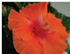
NEW! Nassau Wind (USPPAF) A dark but bright orange with large 5 to 5¼" flowers. More compact habit makes it suitable for 4½" pots. Recommended for 4½", 6" or larger pots.