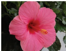
NEW! Cayman Wind (USPPAF) A showy lavender pink with a red throat and large 5½" flowers. Good self-branching. Recommended for 6" or larger pots.