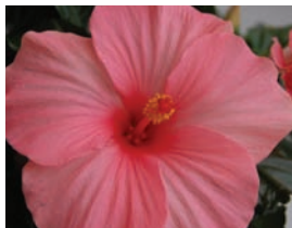
NEW! Somoa Wind (USPPAF) A dark pink with a small dark pink throat. Large 5½" blooms. Smaller foliage and a more compact habit. Recommended for 4½", 6" or larger pots.