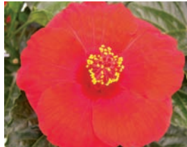
NEW! Trinidad Wind (USPPAF)

Dark red with a darker red throat. Flowers are somewhat smaller than Tonga Wind, but has better self-branching. Recommended for 4½", 6" or larger pots.