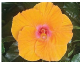
Montego Wind (USPP #17952) Orange blooms with a pink band and a pink throat. Large blooms are 5½ to 6". Recommended for 4½", 6" or larger pots.