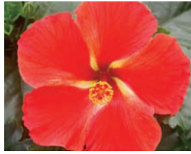
Starry Wind (USPP #17491)

An all-time favorite. Bright red 6" + flowers. Recommended for 6" or larger pots.