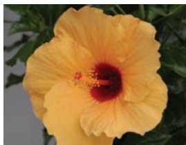
NEW! Aruba Wind (USPPAF) A yellow-orange flower with a burgundy throat. Flowers are approximately 5". Recommended for 6" or larger pots.