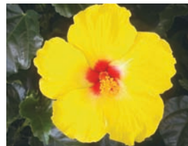
Sunny Wind (USPP #17623) A dark, clear yellow with a red throat. Color is darker than Bonaire Wind and a clearer yellow than Aruba Wind. Large 6 to 6½" flowers. Recommended for 6" or larger pots.