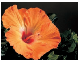
Mandarin Wind (USPPAF) Slightly darker orange than Carolina Breeze with a pink band throat. Flowers are very large at 6 to 6¾". Recommended for 6" or larger pots.