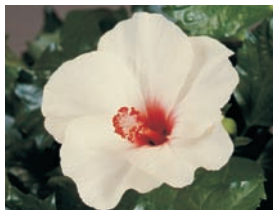
Cool Wind (USPP #12887) A pure white with a pink throat and large 4¾ to 5¼" flowers. Recommended for 4½", 6" or larger pots.