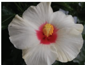
NEW! Tobago Wind (USPPAF) White with a touch of cream and a dark pink throat. Its vigor only makes it suitable for 6" or larger pots.