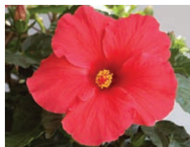
NEW! Antigua Wind (USPPAF) A brilliant red color with a deep red throat. Large 5" flowers. Buds up early and controllable with PGRs. Recommended for 4½", 6" or larger pots.