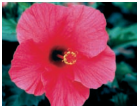
Pink Versicolor A long-time favorite. Bright pink with a dark pink throat. Recommended for 4½", 6" or larger pots.