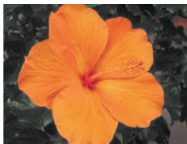
Carolina Breeze (USPP #11779) A bright orange with 4¾ to 5¼" flowers. Recommended for 4½", 6" or larger pots.