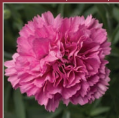
Sherbet (USPP #21418)