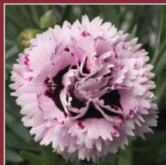
Fizzy (USPP #21394)