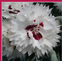
NEW! Silver Star