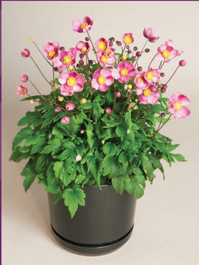
'Pretty Lady Diana' (USPPAF)

Full sun to part shade. USDA Hardiness Zones 5 to 9; AHS Heat Zones 9 to 1. In the garden, plants grow to 16 inches (41 cm) tall and 20 inches (51 cm) wide. Flowering height in containers is 18 inches (46 cm) tall for 'Pretty Lady Diana' and 'Pretty Lady Emily', 12 inches (30 cm) tall for 'Pretty Lady Susan'. Prefers moist soils and will not tolerate long periods of dryness. Provide extra shade in very warm climates.