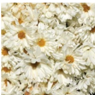
Dendranthema 'Icicle Igloo' USPP#26667