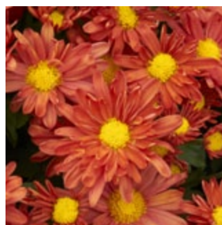
Dendranthema 'Pumpkin Igloo' USPPAF