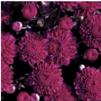
Dendranthema 'Cool Igloo' USPP#20225