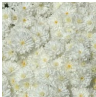
Dendranthema 'Frosty Igloo' USPP#20251