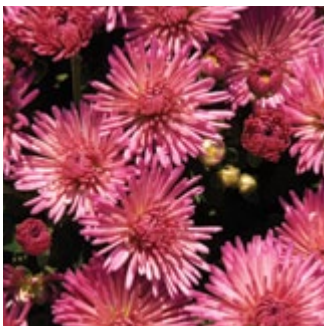
Dendranthema 'Fireworks Igloo' USPP#26666