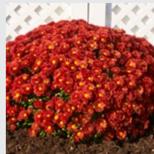
NEW! Dendranthema 'Firedance Igloo' USPPAF