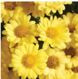
Dendranthema 'Sizzling Igloo' USPP#26668