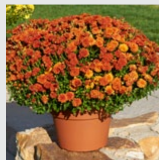
Dendranthema 'Harvest Igloo' USPPAF