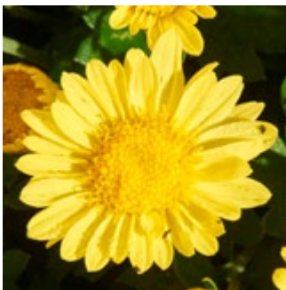
Dendranthema 'Sundance Igloo' USPPAF