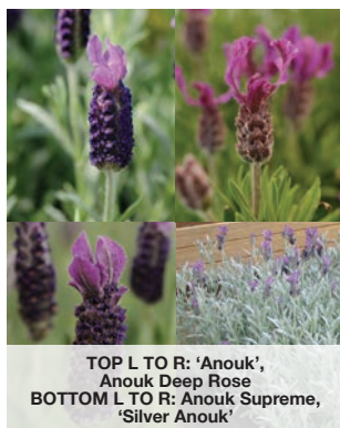
TOP L TO R: 'Anouk', Anouk Deep Rose BOTTOM L TO R: Anouk Supreme, 'Silver Anouk'

Native to the Mediterranean, Spanish Lavender performs well in hot, dry climates. Most varieties are tender, hardy to Zone 7. Spanish Lavender types have a unique flower form. Each flower stem is topped with larger pink or purple bracts crowned with similarly colored upright flags. The foliage is similar to English Lavender varieties, but a little softer.