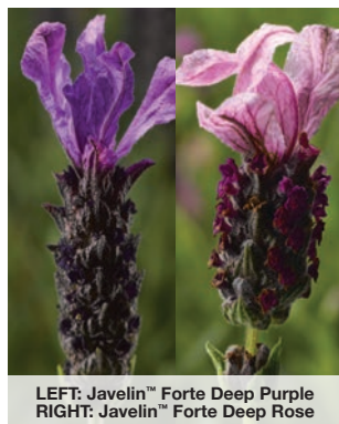
LEFT: Javelin™ Forte Deep Purple RIGHT: Javelin™ Forte Deep Rose