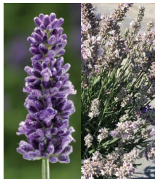
LEFT: Vintro™ Blue, RIGHT: Vintro™ White