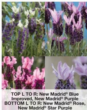
TOP L TO R: New Madrid® Blue Improved, New Madrid® Purple BOTTOM L TO R: New Madrid® Rose, New Madrid® Star Purple