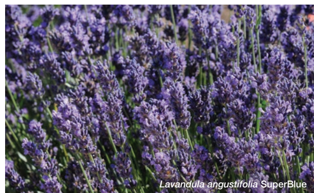
Lavandula angustifolia SuperBlue