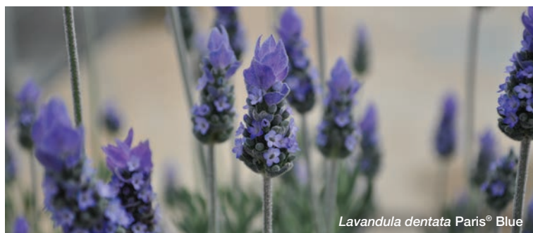
Lavandula dentata Paris® Blue