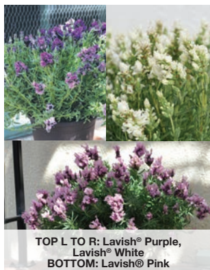
TOP L TO R: Lavish® Purple, Lavish® White BOTTOM: Lavish® Pink